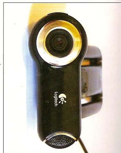
The Meridian Exeda can be fitted with an in-coach camera to send 'live' images back to base

"The Meridian Exeda represents a new generation in mobility management, helping transporters maximise profit margins by making their customers' experience more convenient, safe and enjoyable."